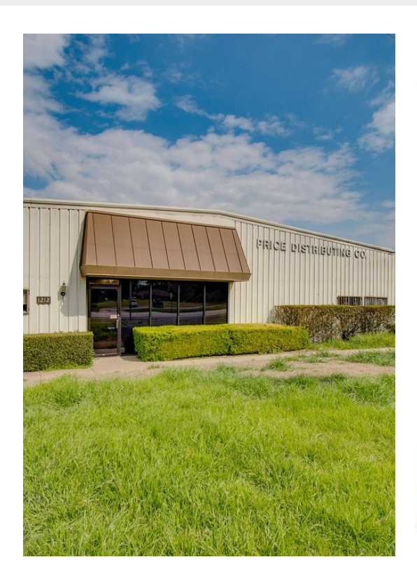
Formerly Price Distributing Co. 1212 S Clay St, Ennis, TX 75119